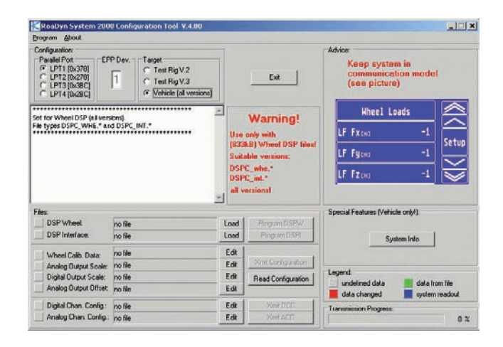
Bild 1: Entry-level window RoaDyn® Remote Control Emulation Software

The DSP software update requires experience with the various versions and characteristics of the RoaDyn System 2000. Programming of the DSP cards with faulty or wrong program versions may result in the RoaDyn System 2000 no longer being able to communicate with the user. The DSP interface card (MDSP/IDSP) must then be sent in to Kistler for complete reprogramming.