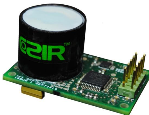
COZIR™ Wide Range Sensor