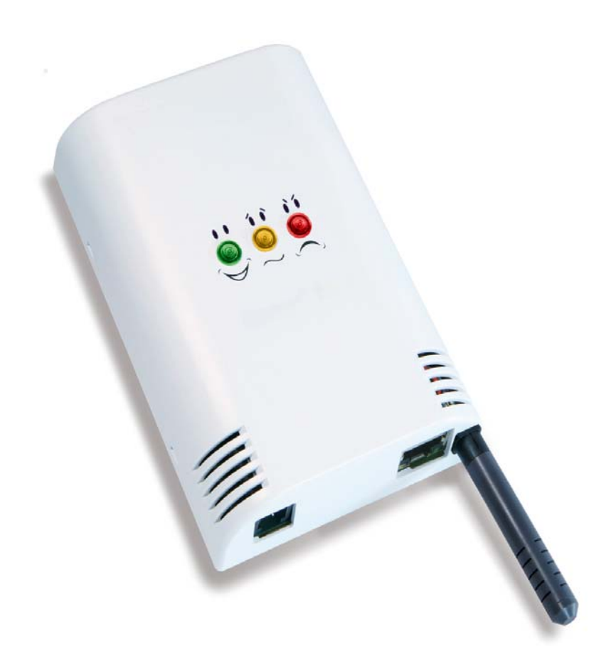
Fig. 1: AQ-CLIMATE CONTROL sensor system.

A two-beam infrared sensor (NDIR) is mounted on a sensor holder inside the plastic housing and above a diffusion opening to measure the carbon dioxide concentration. The sensors for the relative humidity (15 to 95 % RH) and temperature (0 to 50° C) are located in a sensing element made of PVC protruding from the bottom of the housing. The microprocessor for processing data, the digital outputs and an actuator (relay contact) are additionally integrated in the housing (see Fig. 1).