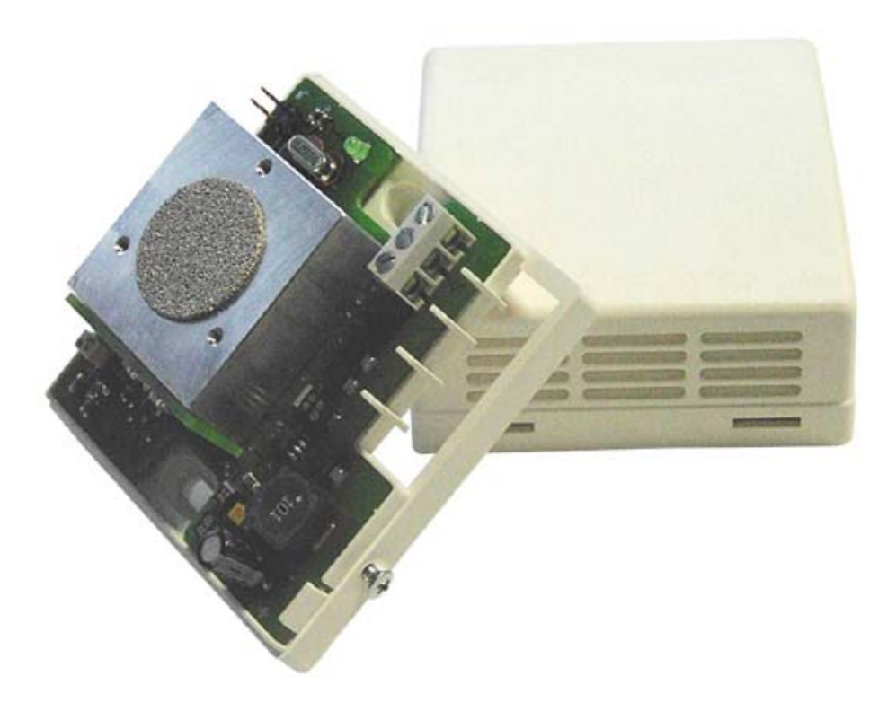
Fig. 1: Gas measuring system AQ-Transmit.

The two-beam infrared sensor is mounted in a plastic housing on a sensor holder above the diffusion opening. In addition, a transmitter containing a signal amplifier and an output of 4-20 mA or 0-10 V is arranged in the housing. The transmitter based on the three-wire system processes and transmits the measured signals (see Fig. 1).