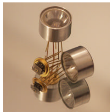
Package TO-5 with Parabolic Reflector

•Related products: PD24-03 can be used in optical pair with our LED16÷LED23 and LD200÷LD230 . We offer the preamplifier model AM-04 suitable for PD24-03