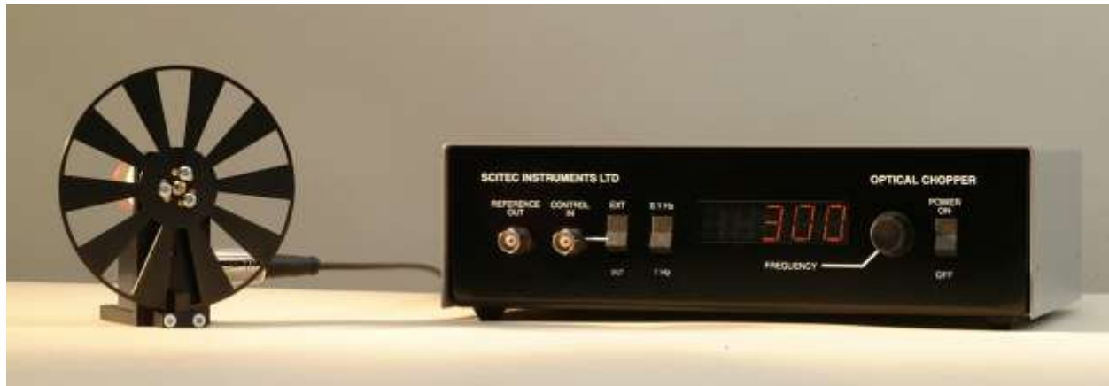
↓ Model 300CD