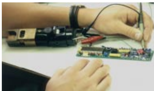
Electronic board repairs

SDI uses a combination of NIST Traceable Force Standards and NIST Traceable dead weights to perform calibrations.