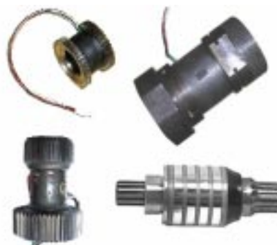
Nut Runner Transducer repairs